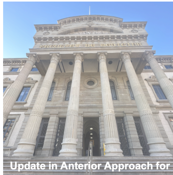
Update in Anterior Approach for Total Hip Replacement

*In the event that the surgery is not possible live, for reasons beyond the control of the organization, there will be a recorded video to be commented on during the assigned time during the course